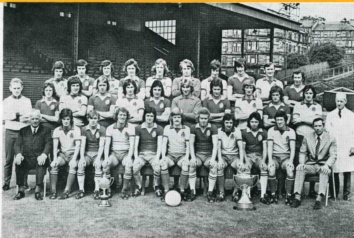
The Partick Thistle F.C. Staff, 1972 - 73